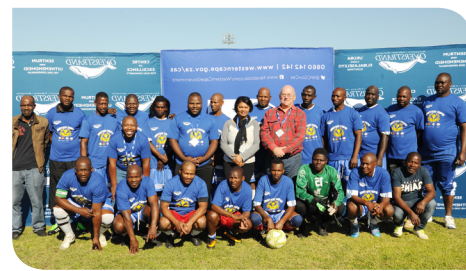
Gansbaai managed to walk away with the legends soccer trophy