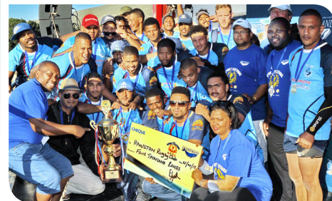
Hawston won the Rugby challenge