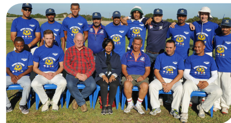
Hawston won the Cricket Challenge

Young Ideas won the soccer final against Team iThemba. Both teams are from Zwelihle.