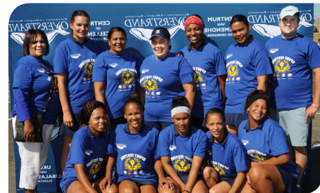
Mount Pleasant Netball team was runners up